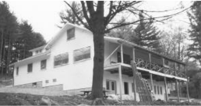
The Lodge, Fall 1994 - Foundation and addition complete